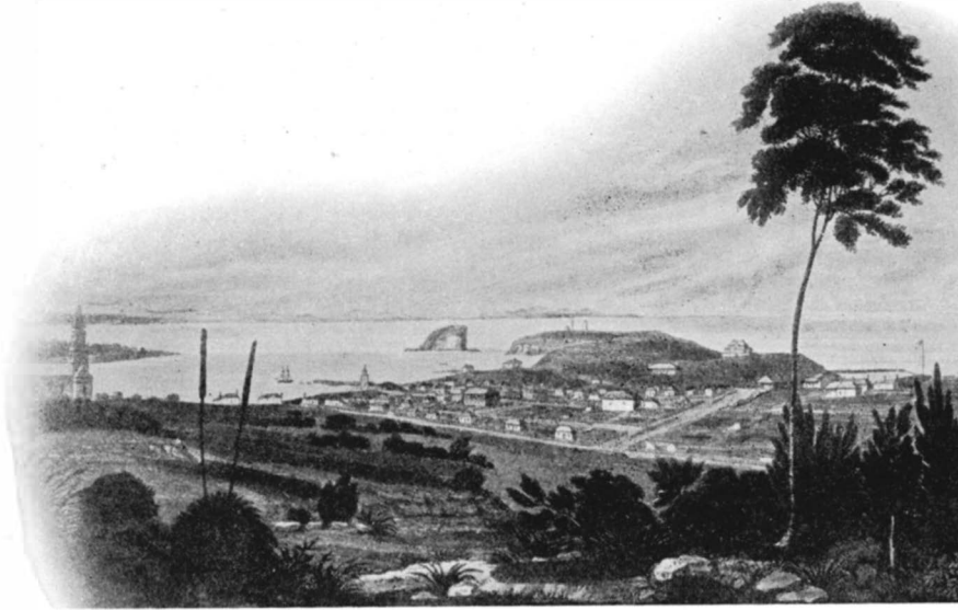
NEWCASTLE, NEW SOUTH WALES

The two Standfields are sent to Newcastle