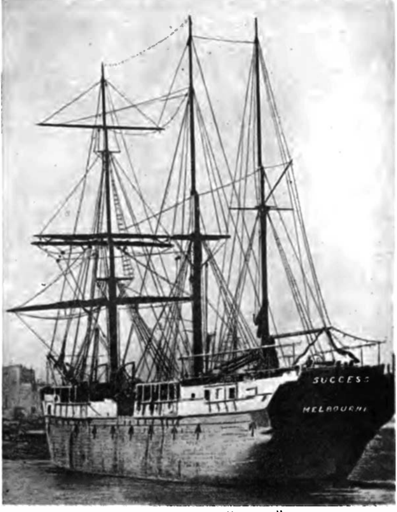
THE CONVICT SHIP "SUCCESS"

It must be remembered that 100 years ago, people could be and were sentenced to transportation for what to-day would be regarded as the most trivial offences. To steal a twopenny pork pie or a linen handkerchief was sufficient to bring about transporta-