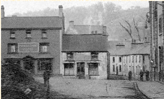
Horse Shoe Inn, Pontnewynydd Was this the beer house of John Llewelyn?

Pontypool is located where old east-west roads intersected the north-south valley. Its place name refers to a bridge built to cross a natural pool in the river. In 1839, the pool was still there, dammed to provide water power.