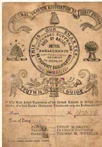
National Charter Association founded July 1840 www.chartists.net