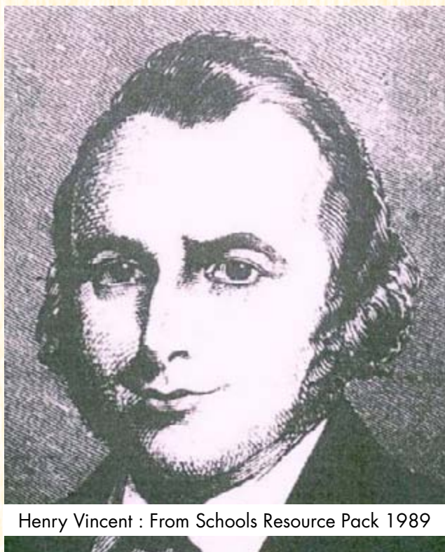
Henry Vincent : From Schools Resource Pack 1989

Climaxing at Newport (20 March) he warned of "the growing snowball of Chartism... oppressors to beware lest it should roll down and crush them"